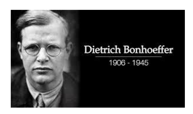
Week 5 – April 9, 2025

based on writings of Dietrich Bonhoeffer