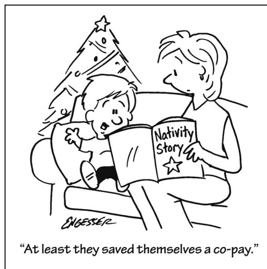
"At least they saved themselves a co-pay."

Holy Trinity sponsors a "Giving Tree" project to assist local families. You can become involved in this project with a purchase of a gift card or make a monetary donation. Gift cards for merchants such as Amazon, Visa, Walmart, Target are versatile and can be used to buy care items as well as food. To make a donation, simply place the gift in the box labeled "Giving Tree Contributions." Please consider giving generously to this worthwhile holiday project.